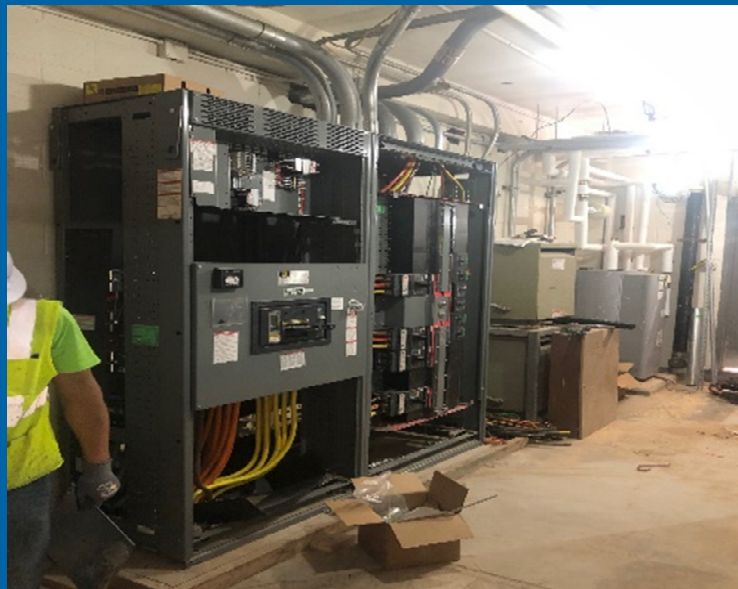
Main Electrical Room Switchgear