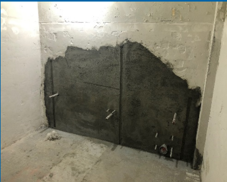
Wall Tile Prep/Patch On-going