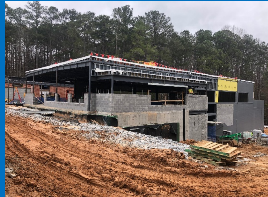
Gymnasium Addition (South East)