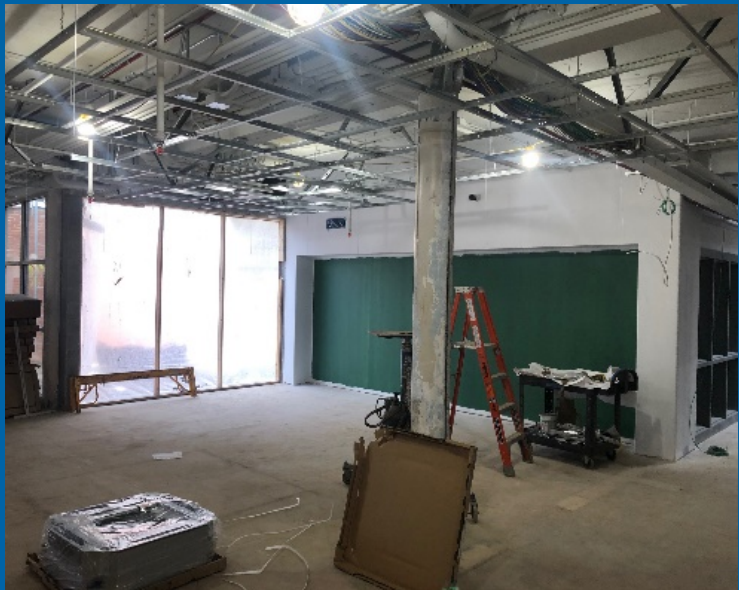
Main Lobby Cloud Ceiling Grid Installation