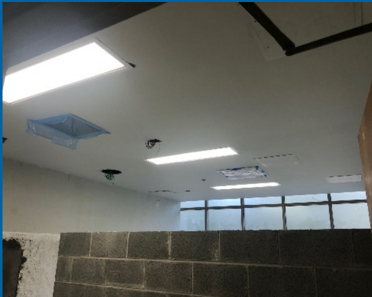
SW Wing Hard Ceiling Trims and Paint