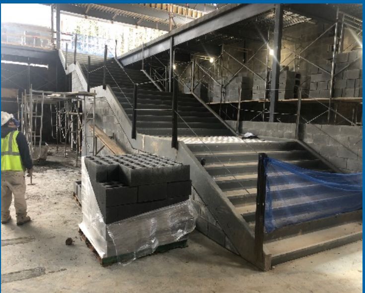
Monumental Stair CMU at Gymnasium