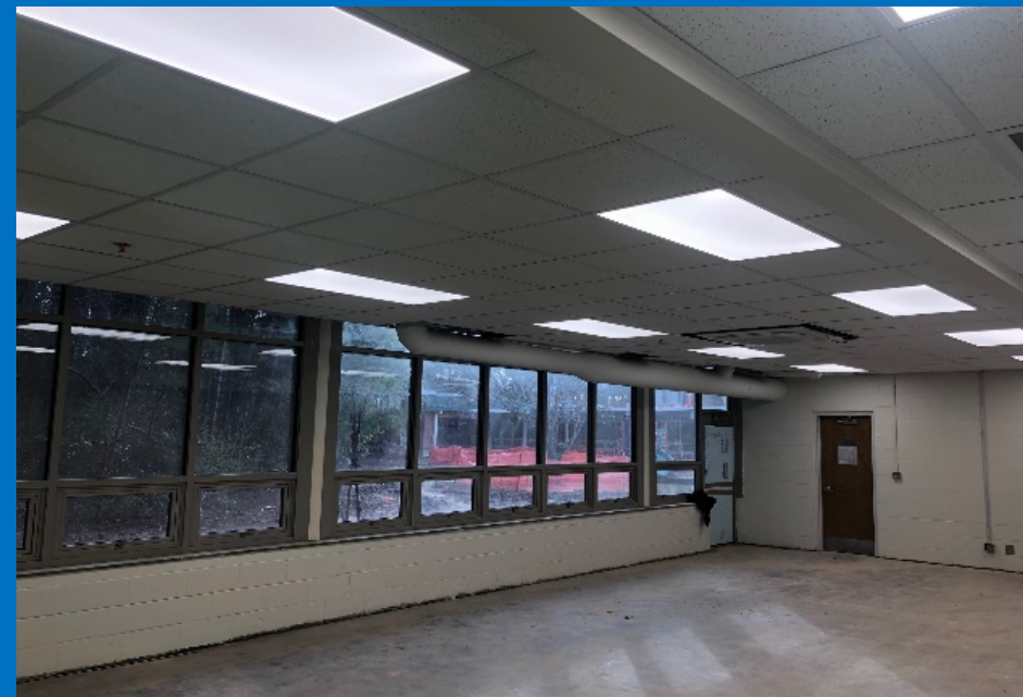
Ceiling Tile Installation at SW Wing